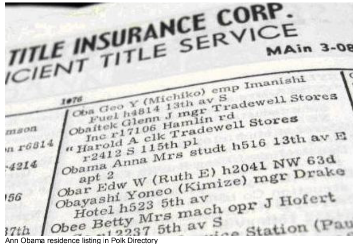
Ann Obama residence listing in Polk Directory

Toutonghi babysat for Dunham during the two extension school courses listed on the transcript that began Dec. 27, 1961. It's likely that all the extension courses were night classes, because the extension classes listed on the transcript that began Aug. 19, 1961, were the same as the winter classes.